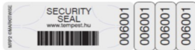
Seal Size: 50 x 20mm + 3 tabs @ 8 x 20mm